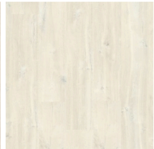
Charlotte oak white