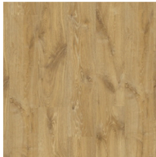
Louisiana oak natural