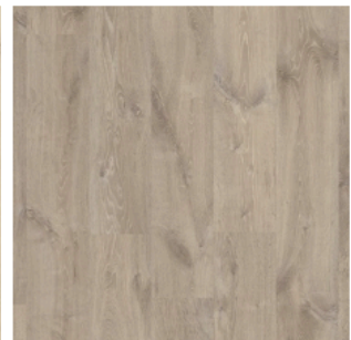
Louisiana oak beige