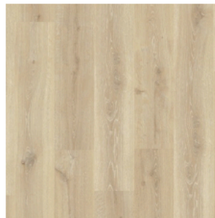
Tennessee oak light wood