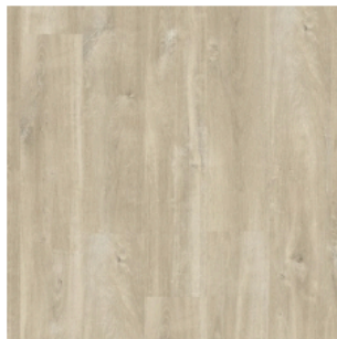
Charlotte oak brown