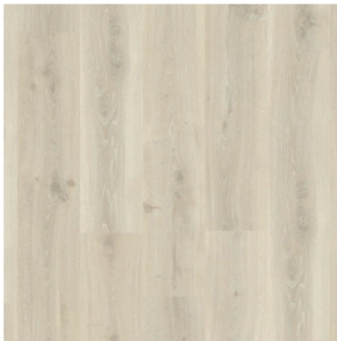
Tennessee oak grey

The grooveless planks of the standard 7 mm thick Creo collection have a streamlined appearance and are fully watertight.