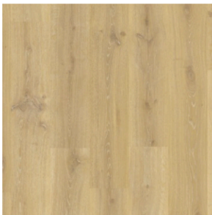
Tennessee oak natural